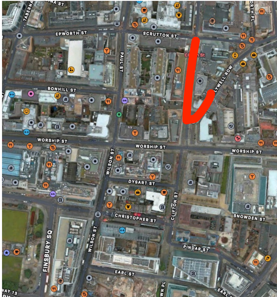
Krankbrother Clifton Street Site 2. Premises Licence Application.