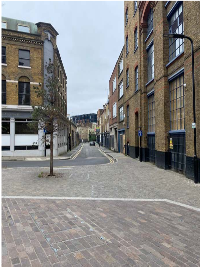
Clifton Street towards Holywell Row